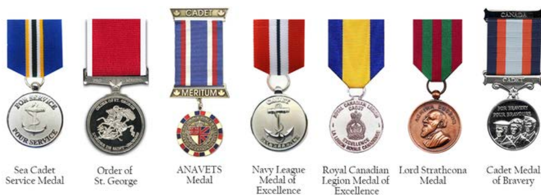
SEA CADET MEDALS IN ORDER OF PRECEDENCE (as worn on tunic)

Cadet Award for Bravery - The Cadet Award for Bravery is a Canadian Forces decoration and is the highest award which may be bestowed on a Canadian Cadet. It is in recognition of an outstanding deed of valour, involving risk to their life, in attempting to save the life or property of another person.